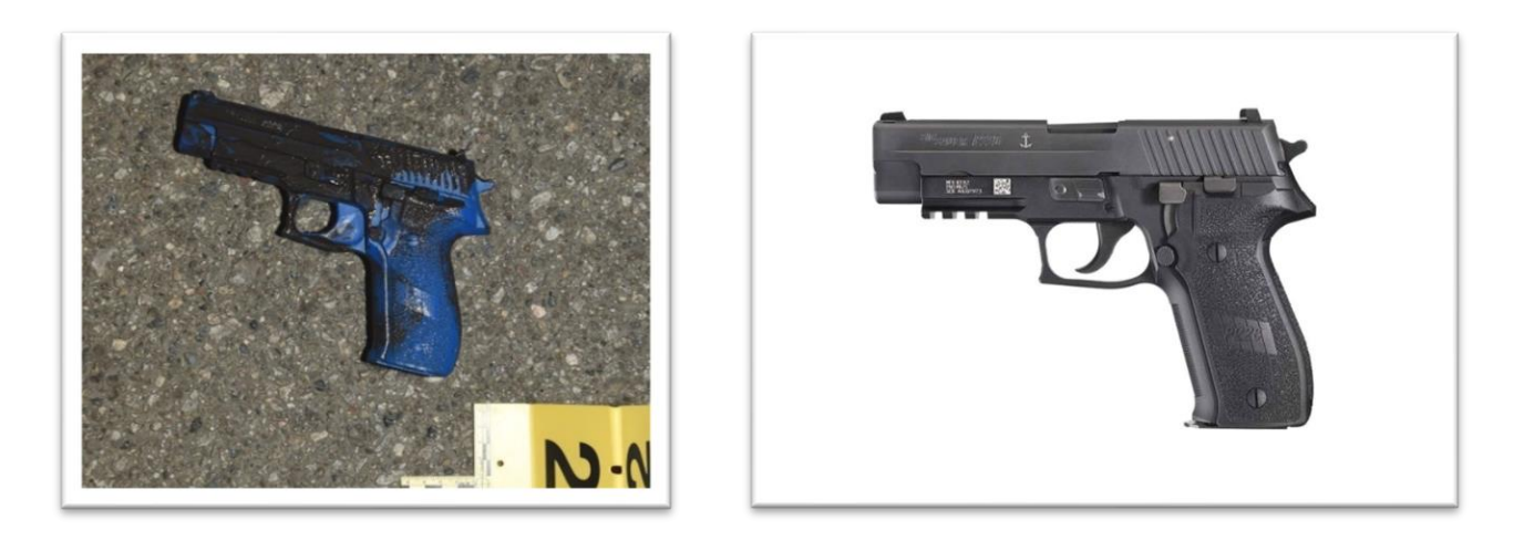
A closeup of Manzano's replica Sig Sauer pistol (L), and an actual Sig Sauer model P-226 semi-automatic pistol (R), presented for comparison.