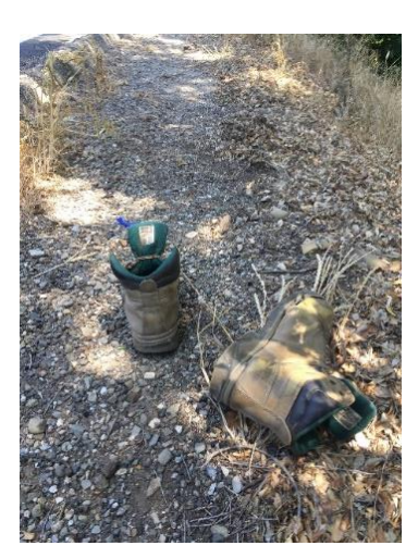
Photograph of Ortiz's discarded red shirt and work boots located on the east shoulder of northbound Highway 33.

Detective Cyrus Zadeh collected Officer Putzel's Smith and Wesson .40 caliber duty weapon at the Ventura County Medical Center. Zadeh noted that it appeared only one round had been fired. That round's shell casing had not been ejected from the gun and was still inside the chamber at the time of the inspection.