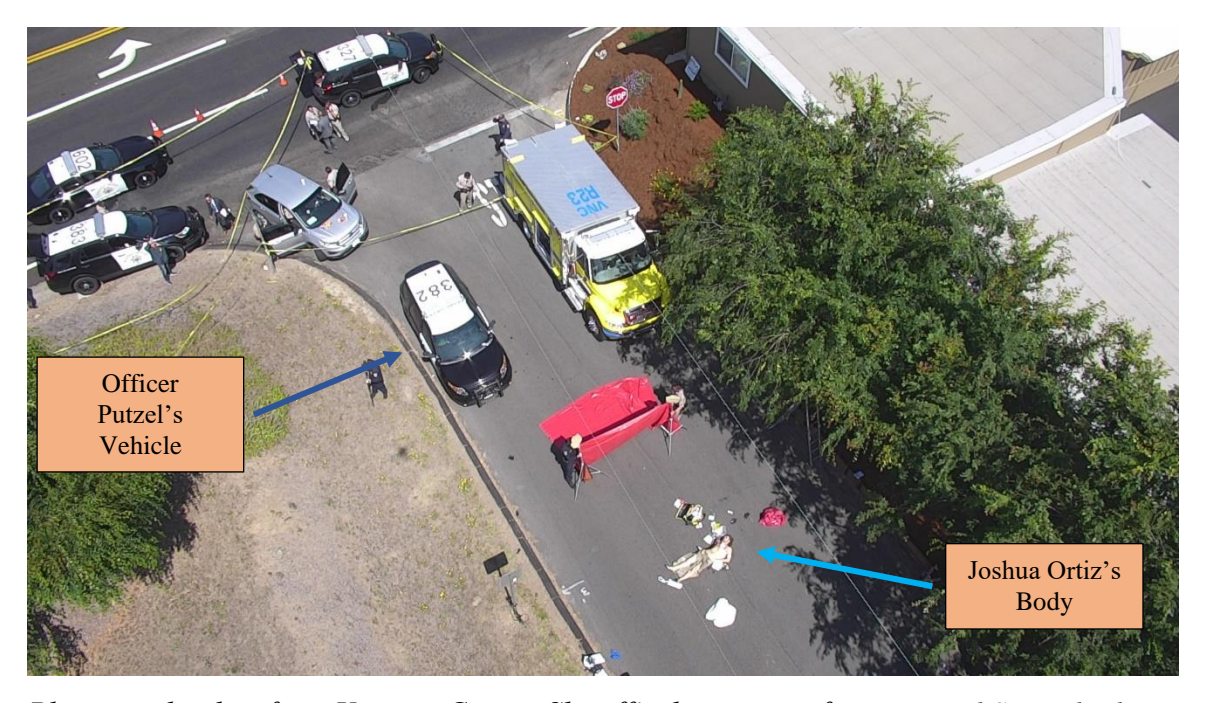
Photograph taken from Ventura County Sheriff's drone unit of East Portal Street looking west to the intersection of Highway 33. Officer Putzel's patrol vehicle is detailed by a blue arrow. Ortiz's body is being shielded from view by a red tarp and detailed with a light blue arrow.

The crime scene occurred on East Portal Street, just east of Highway 33. East Portal Street is a two-lane, asphalt-paved roadway that runs east and west. East Portal Street is situated between Highway 33 and Park Avenue, in the unincorporated area of Ventura County known as Oak View. This area is considered residential and commercial, with businesses and homes on East Portal Street. The street has a slight incline as it runs east from Highway 33. The north side of East Portal Street has a large planter with trees and a wood barrier that runs parallel to the asphalt curb along the street. The south side of East Portal street also has a raised asphalt curb that runs parallel with the street. There are no sidewalks on East Portal Street.