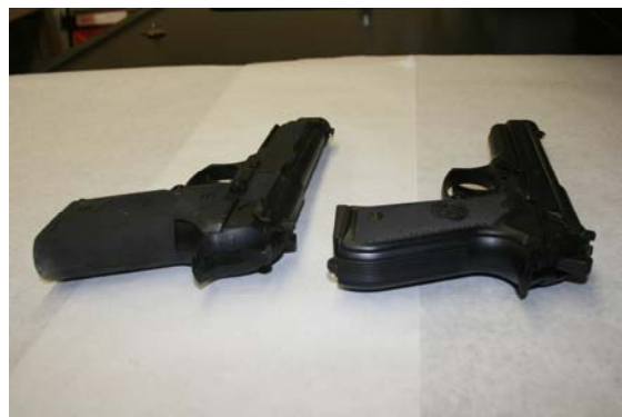
Replica 9mm Beretta firearm carried by Chilson photographed below actual 9mm Beretta pistol